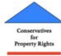
Conservatives for Property Rights