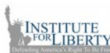
Institute For Liberty