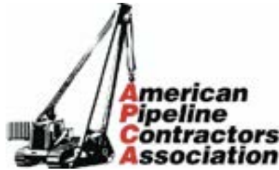
American Pipeline Contractors Association