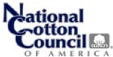
National Cotton Council of America