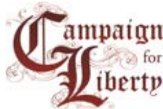
Campaign for Liberty