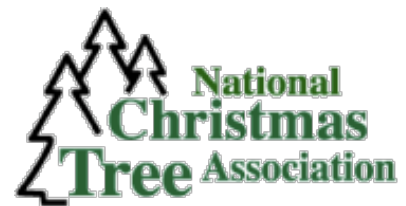
National Christmas Tree Association