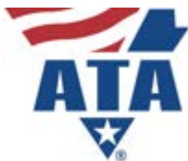
American Trucking Associations