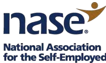
National Association for the Self-Employed