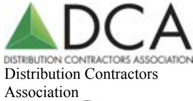
Distribution Contractors Association