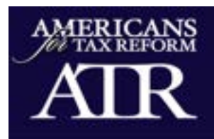
Americans for Tax Reform