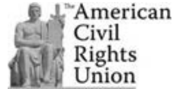
American Civil Rights Union