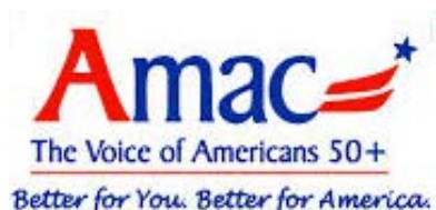
Association of Mature American Citizens